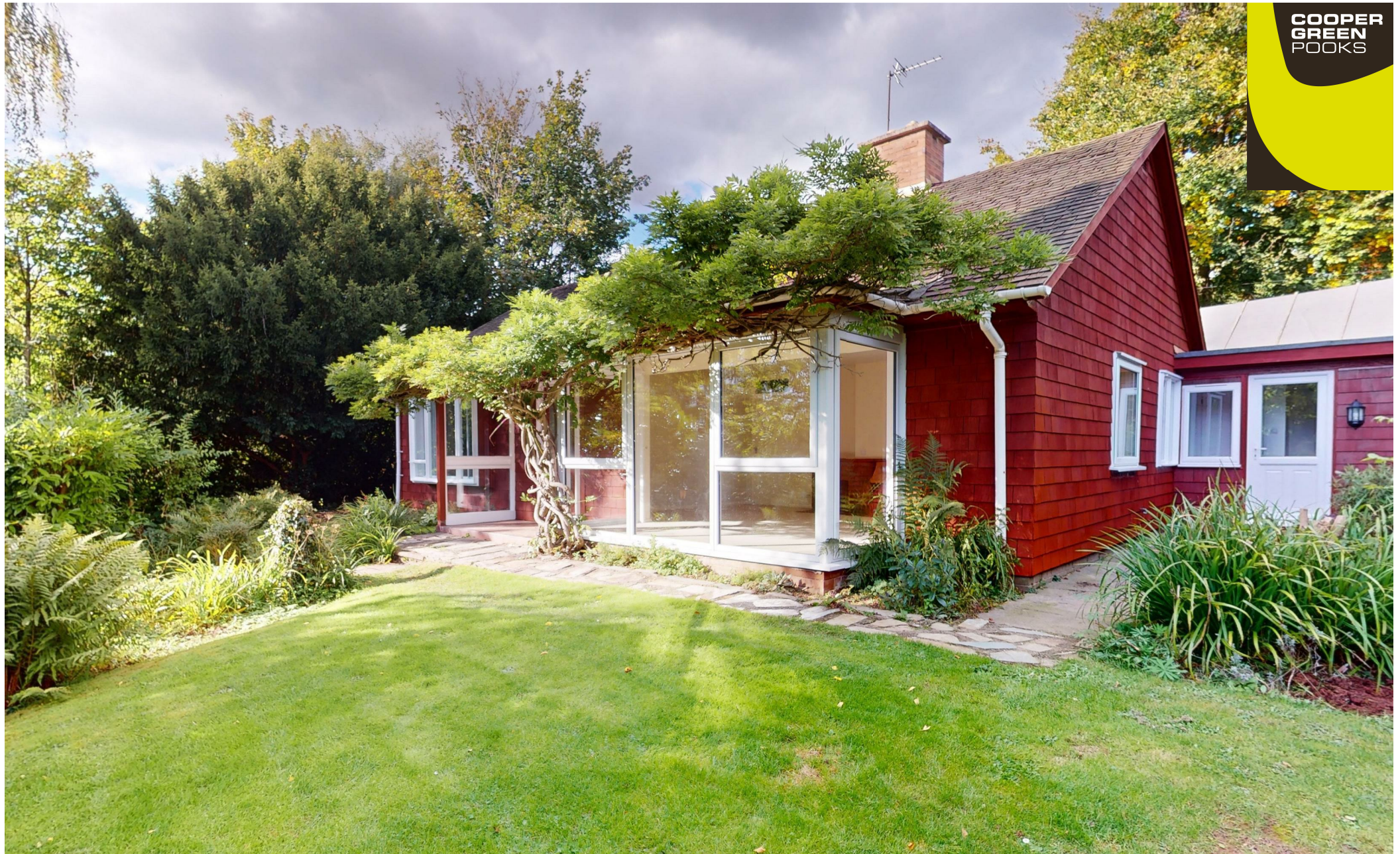
Cedar Lodge, Forton Bank, Montford Bridge, Shrewsbury, SY4 1ER £1,000 Per Month